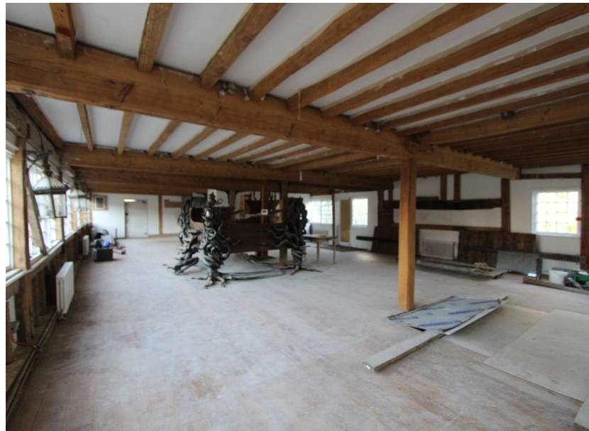
Main Restaurant Floor