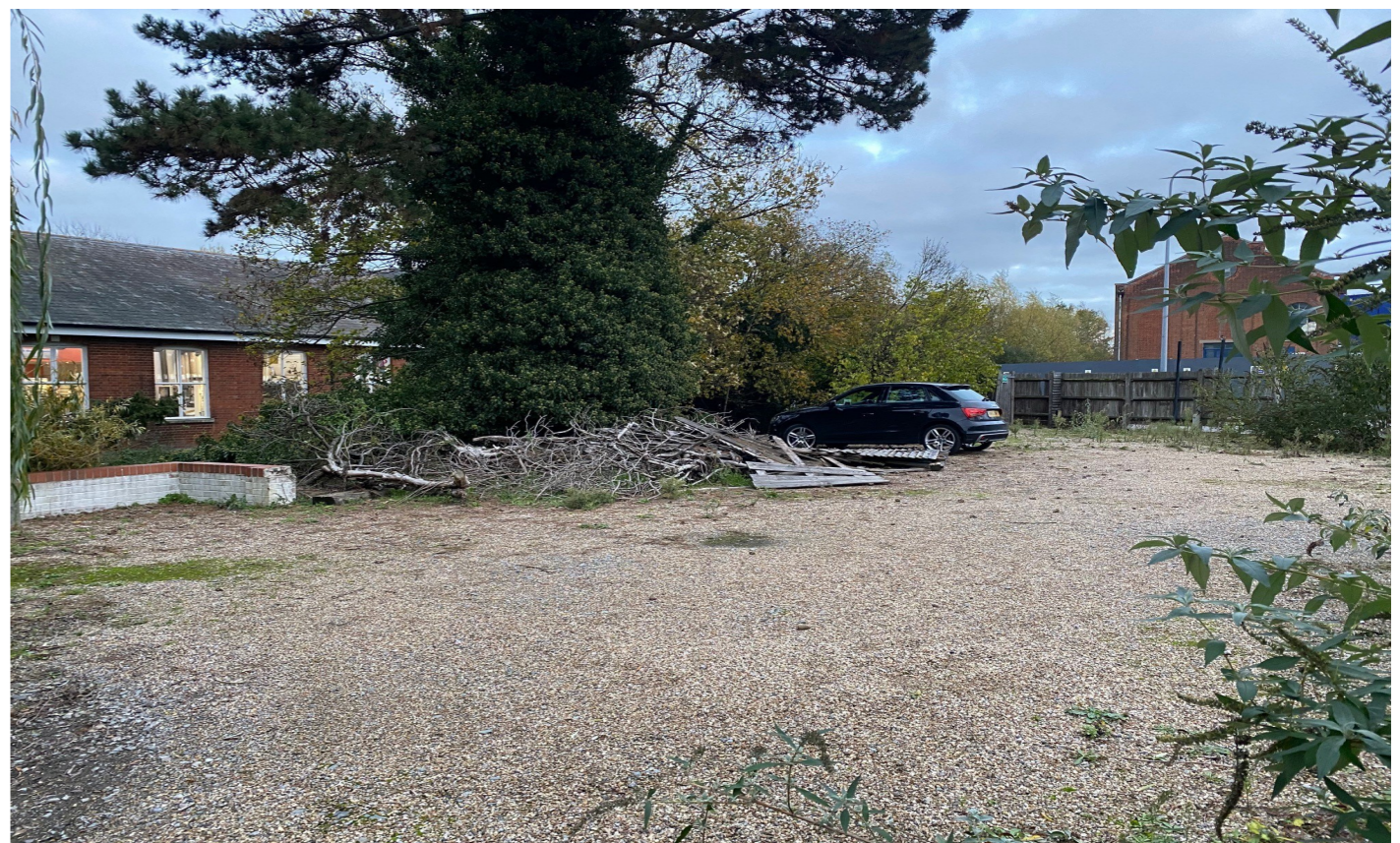
Rear Car Park